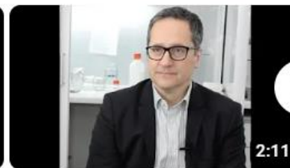
DoI 2023 15 ISoS Interview - Vaccines

Day of Immunology 9 views • 7 months ago