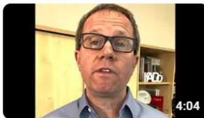
DoI 2023 21 DGfl Interview - Immune System:Pathology

Day of Immunology 38 views • 7 months ago