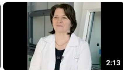
DoI 2023 12 LSI Interview - Immune System

Day of Immunology 38 views • 7 months ago