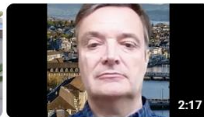
DoI 2023 17 SSAI Interview - Vaccines

Day of Immunology 8 views • 7 months ago