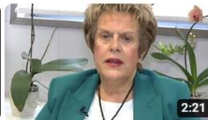
DoI 2023 05 HSI Interview - Immunology

Day of Immunology 38 views • 7 months ago